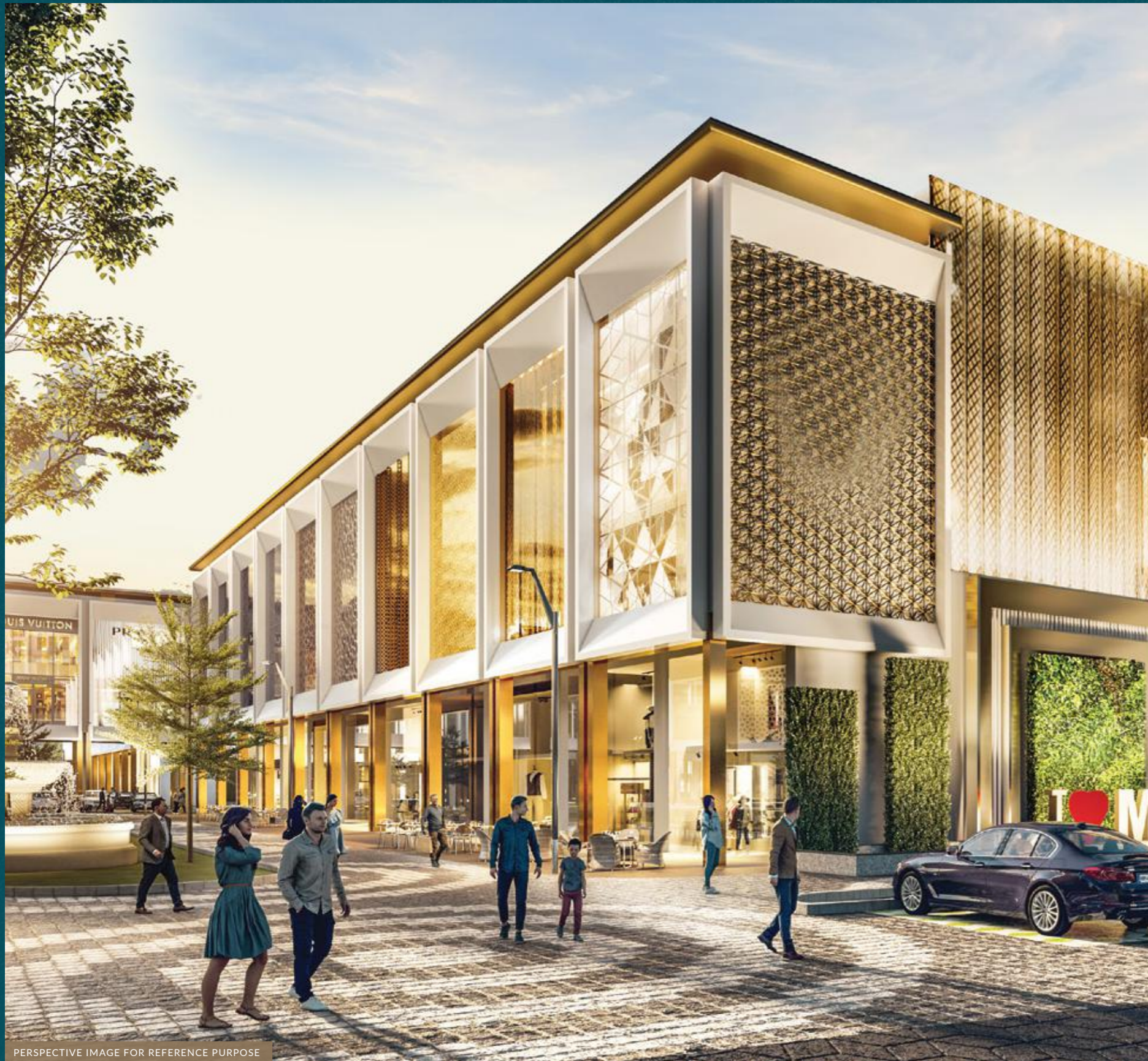
PERSPECTIVE IMAGE FOR REFERENCE PURPOSE