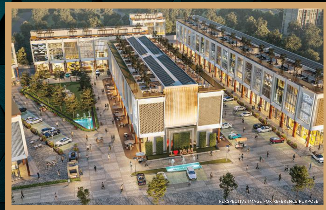
PERSPECTIVE IMAGE FOR REFERENCE PURPOSE

AN INCREDIBLE Opportunity RIGHT AT THE DOORSTEP OF DELHI